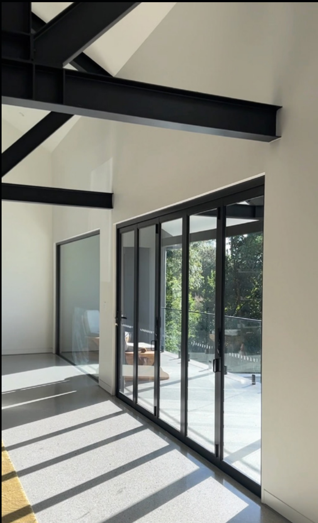
Project: 44-46 Richardson Rd Croydon, VIC