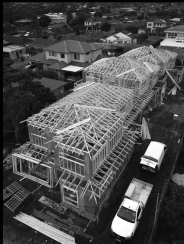
Project: 18 Woodbine Grove Chelsea, VIC.