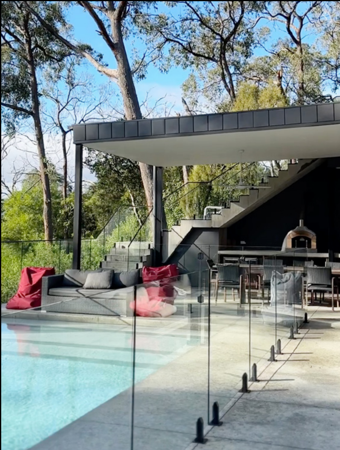
Project: 44-46 Richardson Rd Croydon, VIC