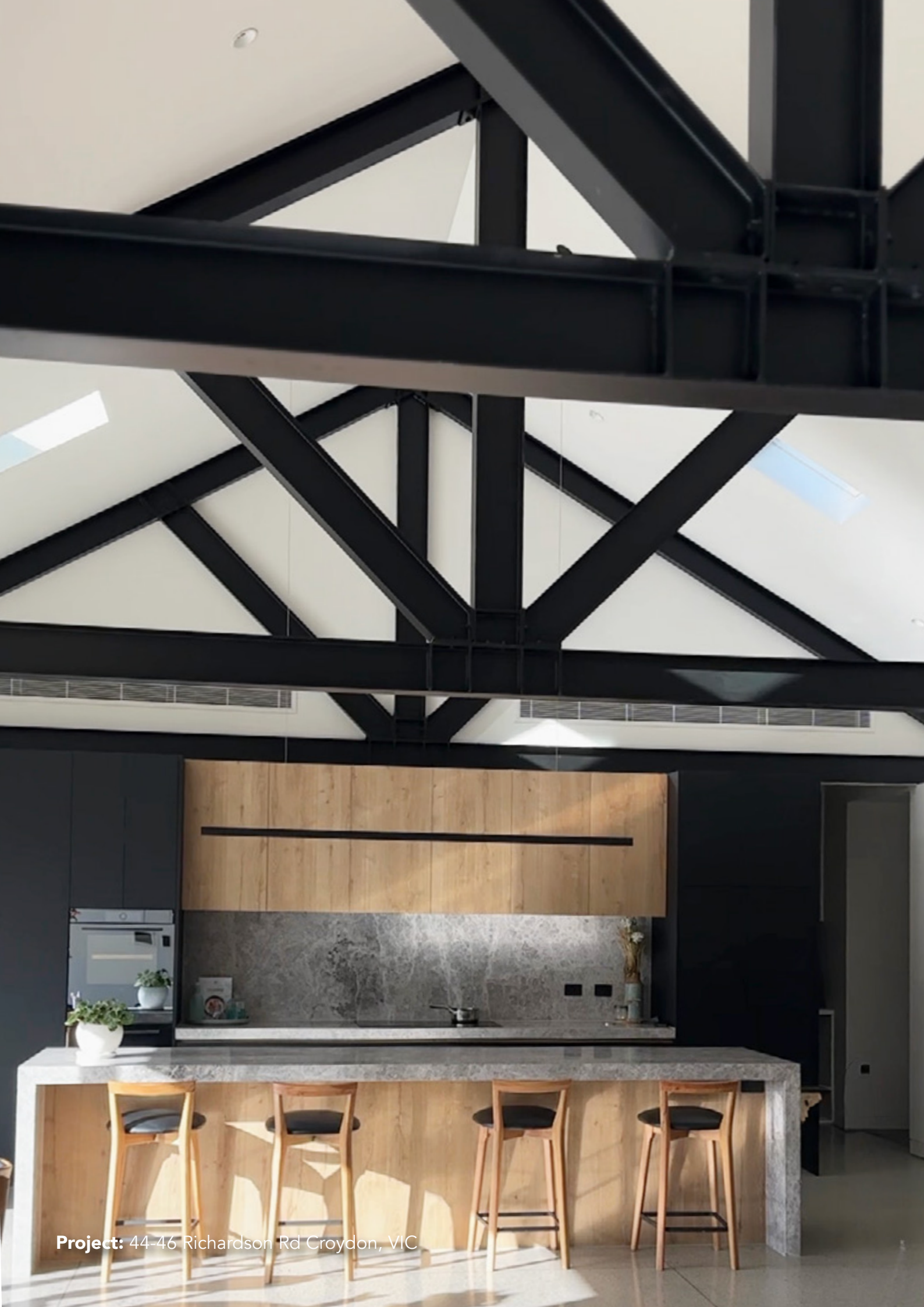
Project: 44-46 Richardson Rd Croydon, VIC