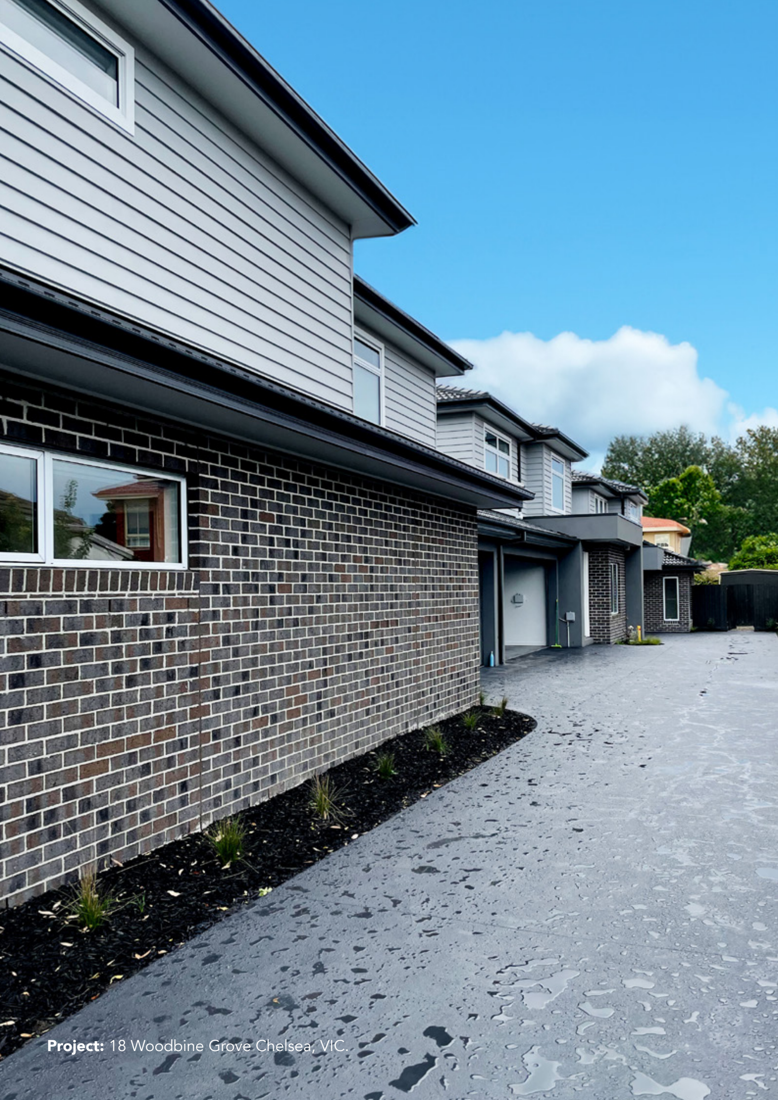
Project: 18 Woodbine Grove Chelsea, VIC.