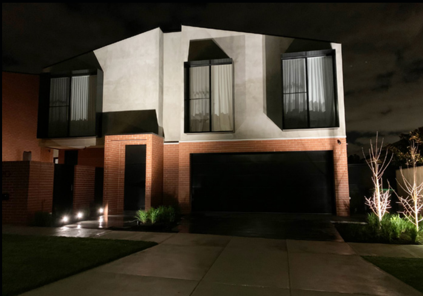
Project: 324 Gillies St Thornbury, VIC