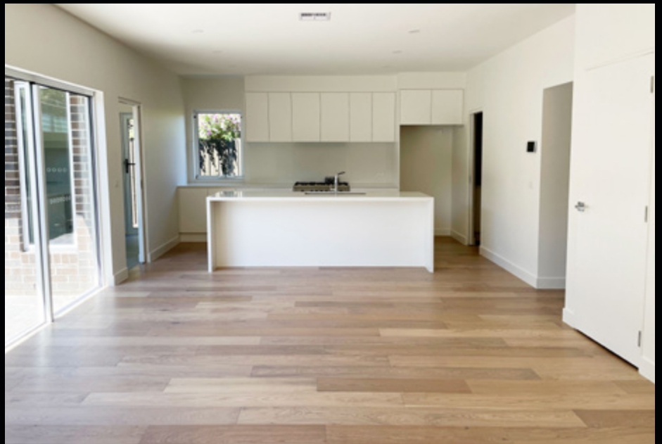
Project: 18 Woodbine Grove Chelsea, VIC.