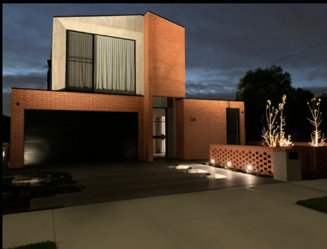
Project: 324 Gillies St Thornbury, VIC