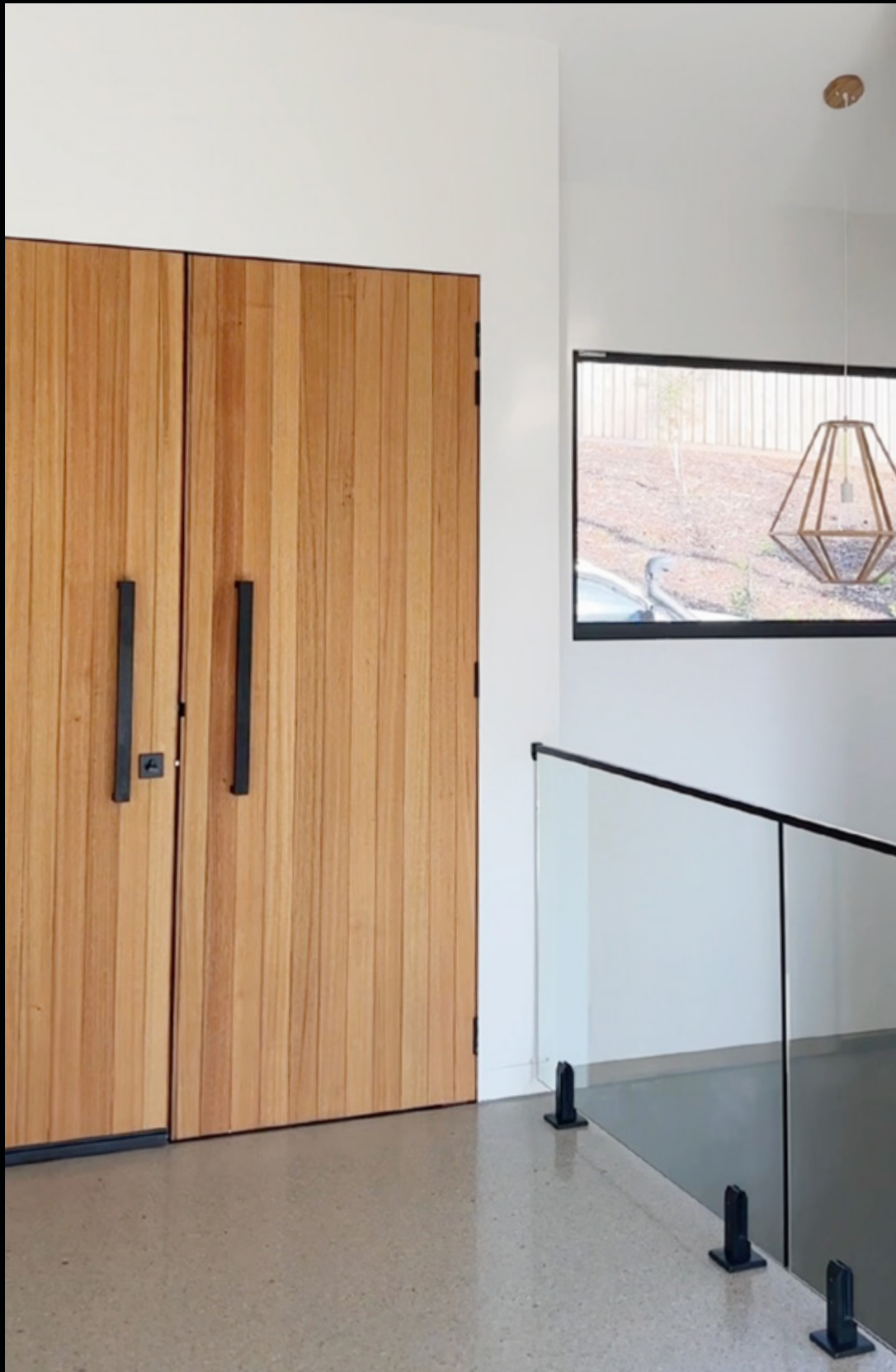
Project: 44-46 Richardson Rd Croydon, VIC