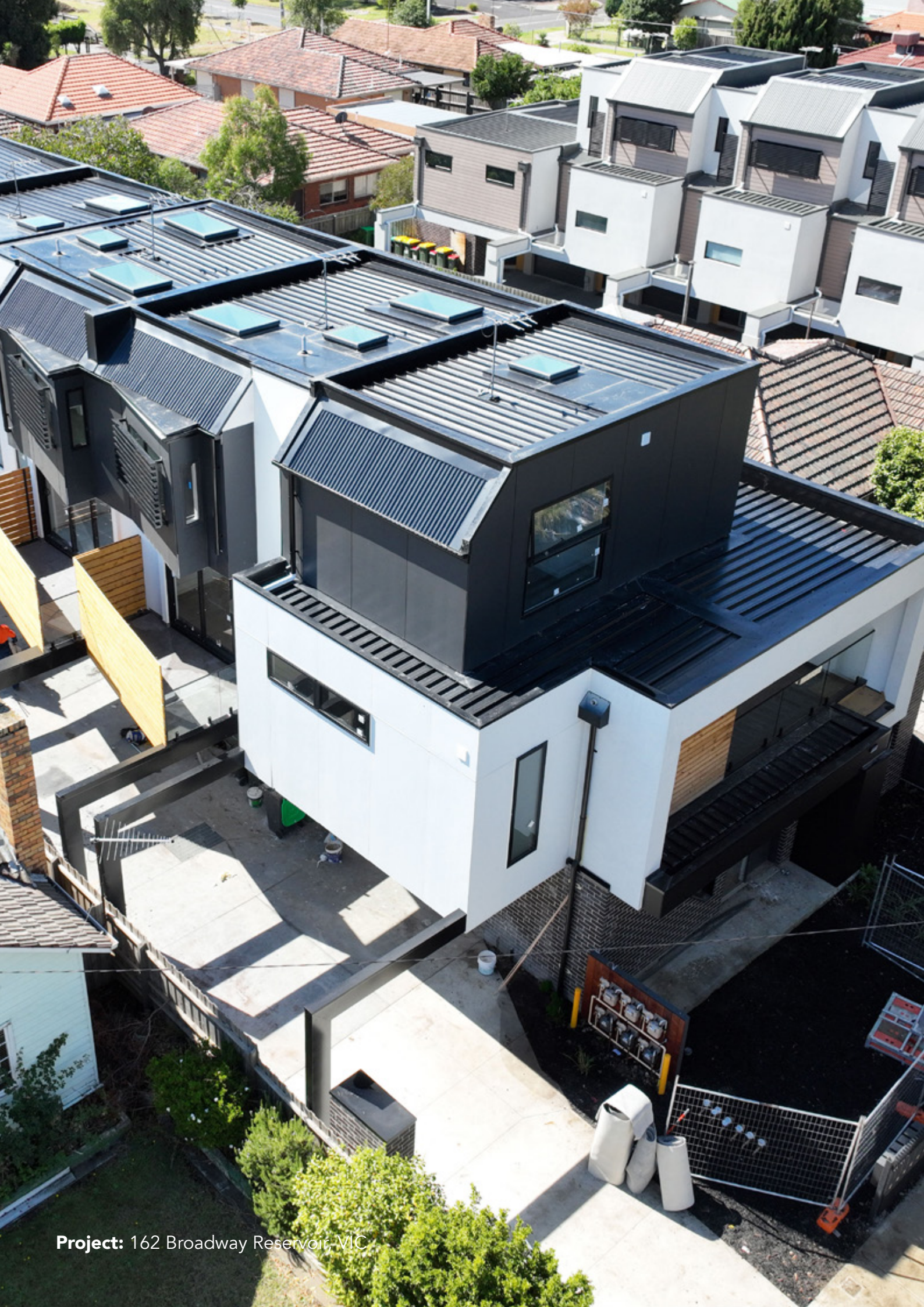
Project: 162 Broadway Reservoir, VIC