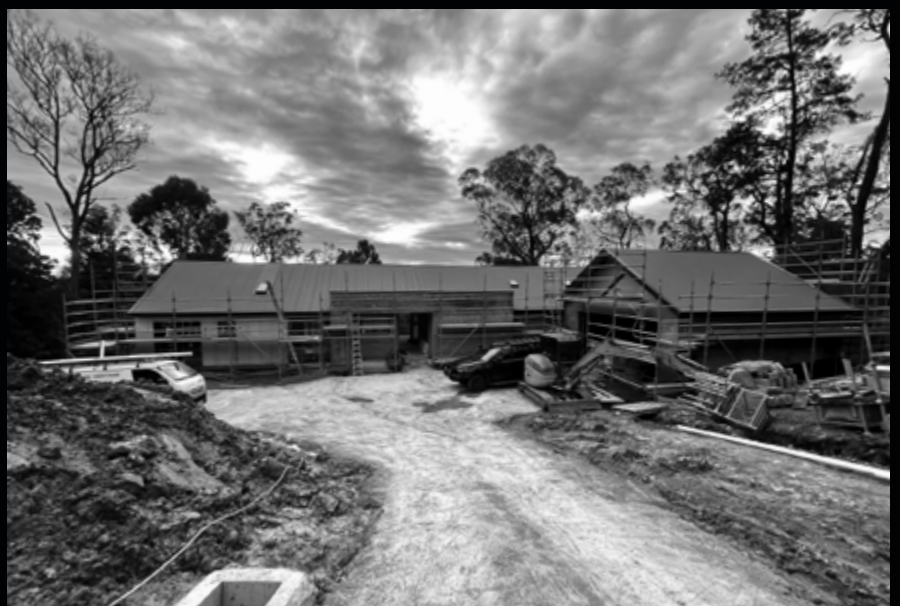
Project: 44-46 Richardson Rd Croydon, VIC