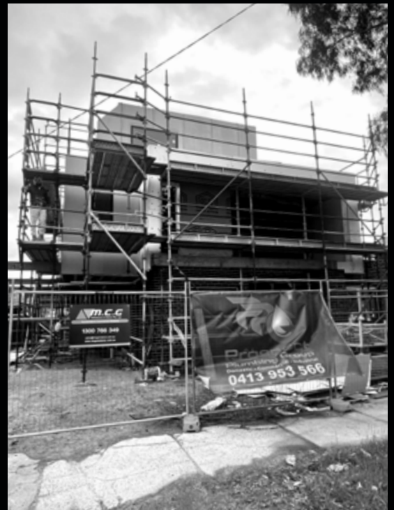
Project: 162 Broadway Reservoir, VIC