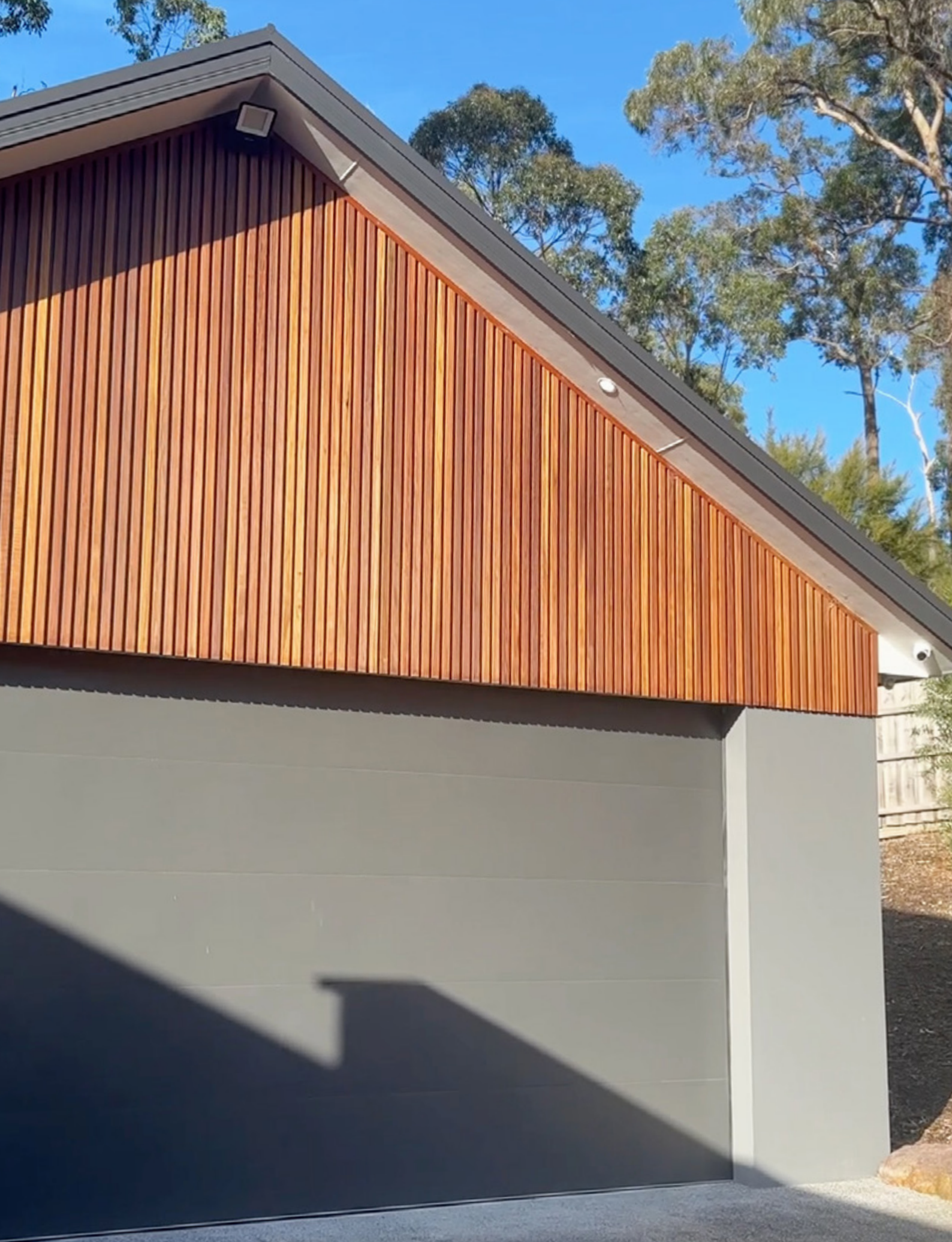
Project: 44-46 Richardson Rd Croydon, VIC