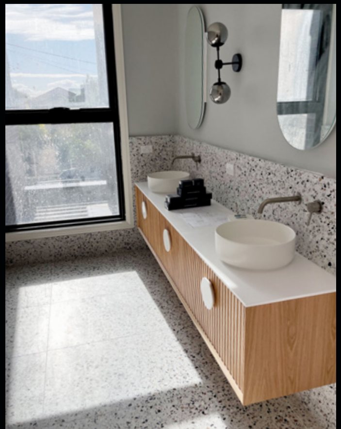
Project: 3 Suffolk Ave Coburg, VIC