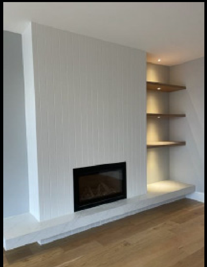
Project: 3 Suffolk Ave Coburg, VIC