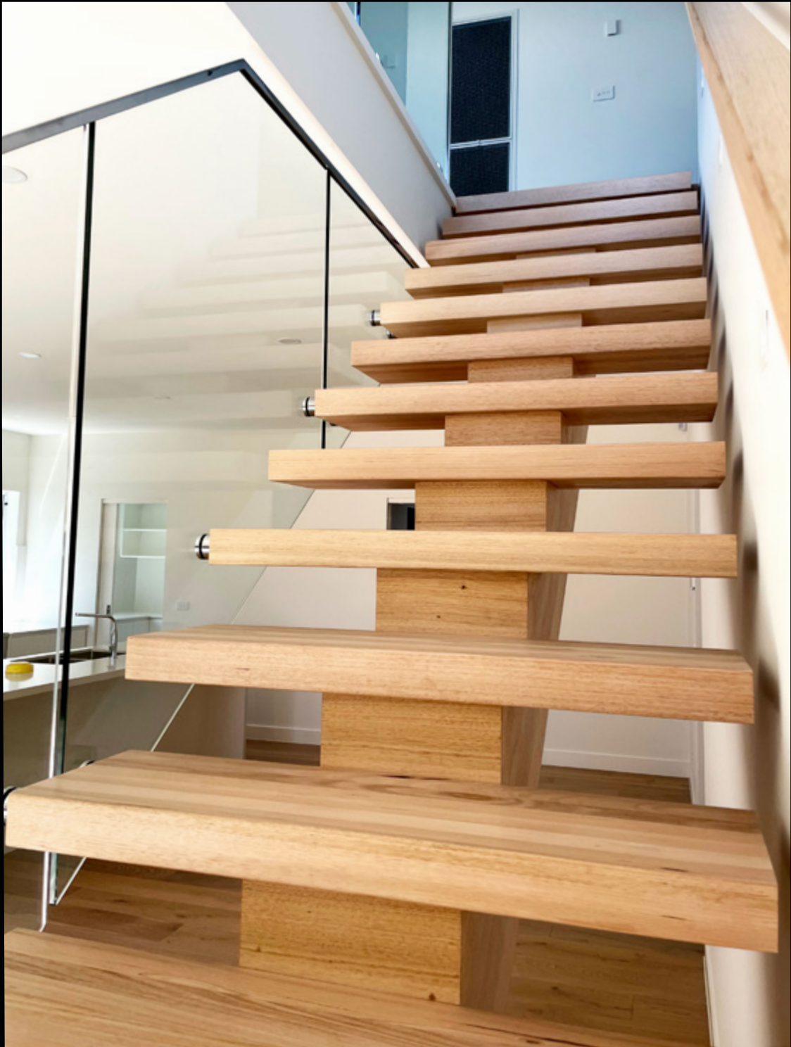
Project: 18 Woodbine Grove Chelsea, VIC.